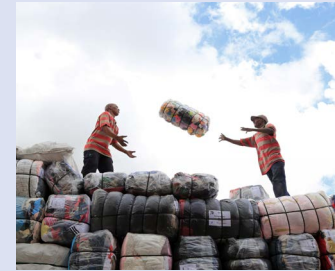
Clothes sale in a market place in Africa

19 M people who donate 134000 tonnes of clothes collected