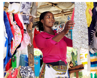
Clothes sale in a market place in Africa

The Federation Humana People to People is a Swiss-registered association. The General Assembly constitutes the supreme authority of the Federation Humana People to People and comprises the 30 member associations. The Committee of the Federation HPP is accountable for both financial and operational activities, with reporting responsibility to all members. Members of the Federation Humana People to People are audited according to international financial and reporting standards. This includes funds received by international partners, also accounted for in line with partnership agreements.